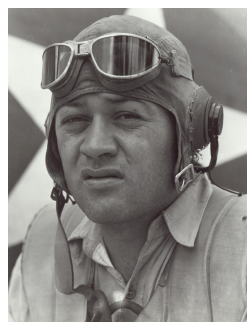
Gregory "Pappy" Boyington