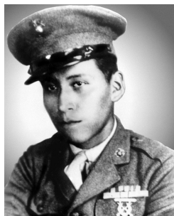
Mitchell Red Cloud