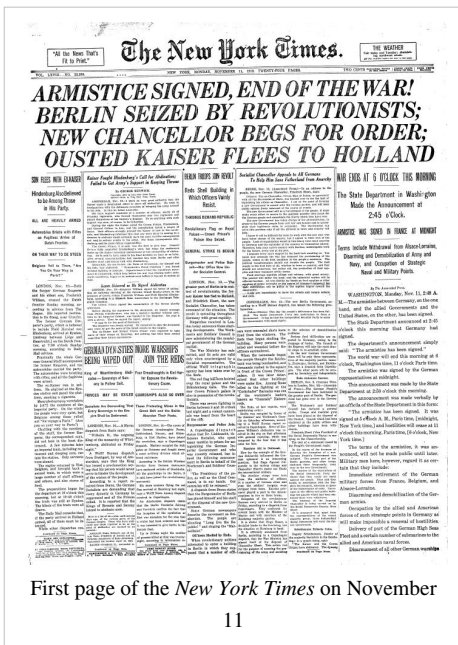
First page of the New York Times on November 11

On 29 September 1918 the German Supreme Command informed Kaiser Wilhelm II and the Imperial Chancellor Count Georg von Hertling at army headquarters in Spa, Belgium, that the military situation facing Germany was hopeless. Generalquartiermeister Erich Ludendorff, probably fearing a breakthrough, claimed that he could not guarantee that the front would hold for another 24 hours and demanded a request be given to the Entente for an immediate ceasefire. In addition, he recommended the acceptance of the main demands of US President Woodrow Wilson (the Fourteen Points) and put the Imperial Government on a democratic footing, hoping for more favourable peace terms. This enabled him to save the face of the Imperial Army and put the responsibility for the capitulation and its consequences squarely into the hands of the democratic parties and the parliament. As he said to officers of his staff on 1 October: "They now must lie on the bed that they've made us." Thus was born the "Stab-in-the-back" notion that the army had not failed, only the civilians.